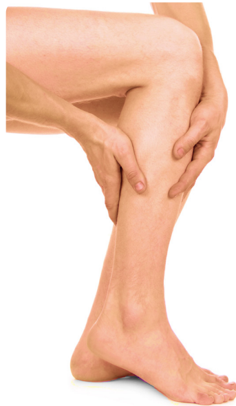
Tired aching legs Legs feel sore and heavy as blood stretches the veins in the legs